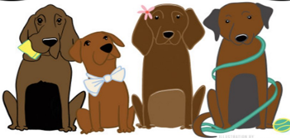
ILLUSTRATION BY WWW.STUDIOEIGHTYSEVEN.COM